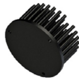
C Mechanical version 3*M3 mounting hole