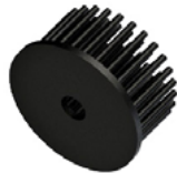
B Mechanical version Center hole \varnothing 11.5mm