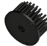
D Mechanical version Center hole \varnothing 11.5mm + 3*M3 mounting hole