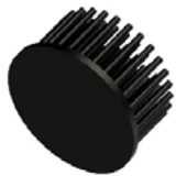
A Mechanical version Solid base